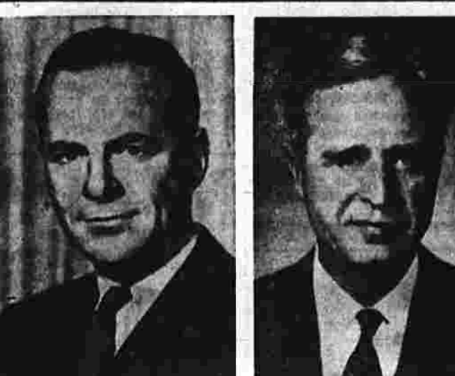
John Lodge, Republican candidate for governor, heads a list of several GOP candidates in the November 7 election.